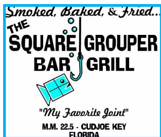
Square Grouper Bar & Grill