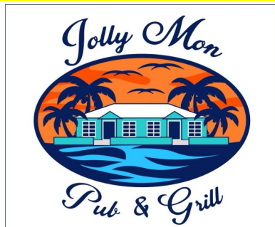
Jolly Mon Pub & Grill