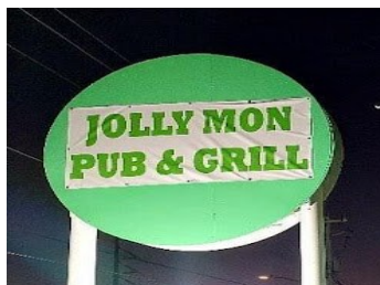
Jolly Mon Pub & Grill