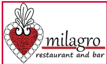
Milagro Restaurant & Bar