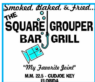
Square Grouper Bar & Grill