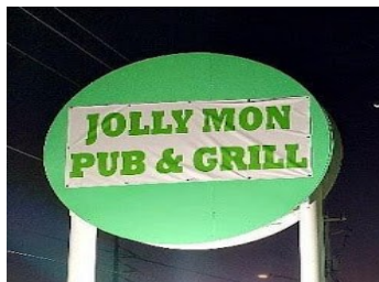
Jolly Mon Pub & Grill