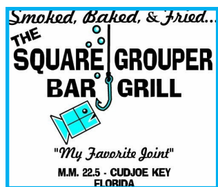
Square Grouper Bar & Grill