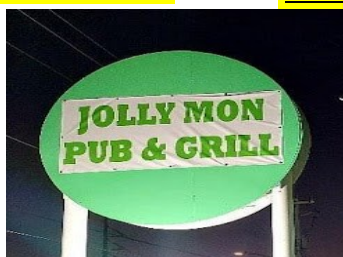
Jolly Mon Pub & Grill

A percentage of the $25.00 goes to our Religious Education Fund and helps finance our Religious Ed. and Scholarship Programs.