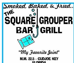
Square Grouper Bar & Grill