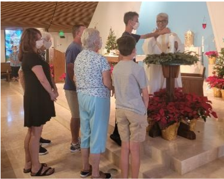
Lighting the Christmas candle