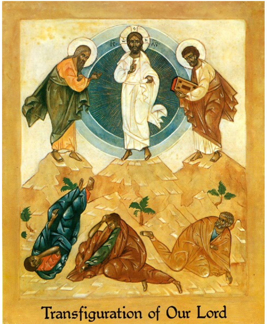
Transfiguration of Our Lord

BAPTISMS, FUNERALS and WEDDINGS (by appointment)